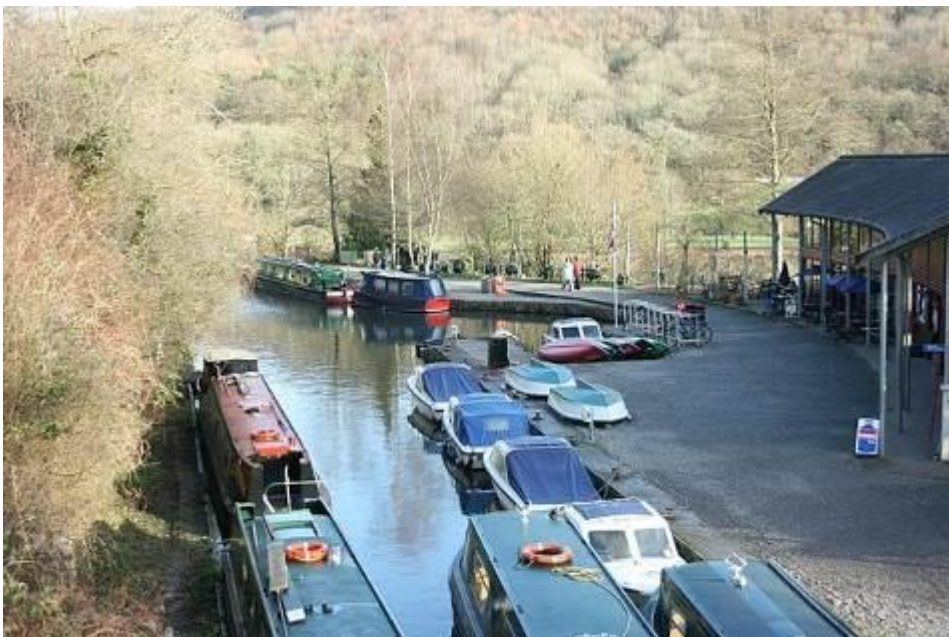
The first section of the Somerset Coal Canal