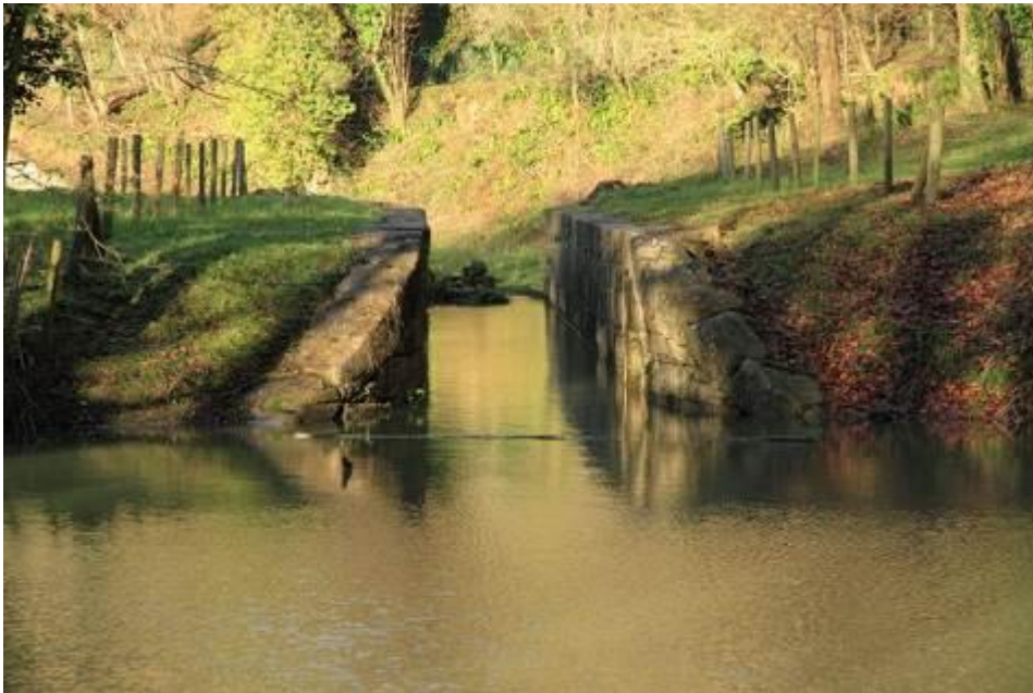
The first of the flight of locks at Combe Hay

6. Create two further haiku poems using these images below: